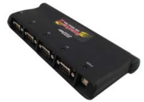
RocketPort USB Serial Hub II 4-Port 98295-1