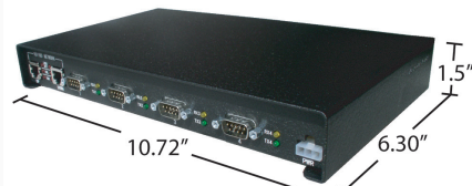
DeviceMaster UP 4-Port Dimensions (in inches) Metric (L 27.23cm X W 16cm X H 3.81cm)