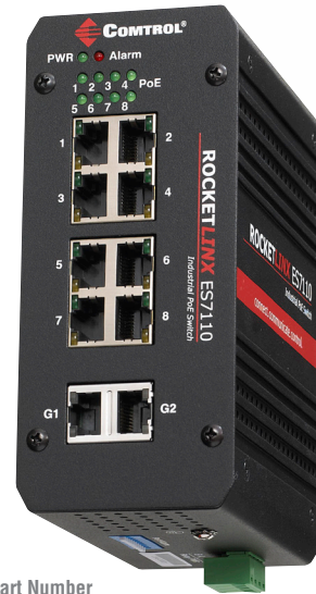
Part Number 32049-4

For more detailed information visit www.comtrol.com/rocketlinx